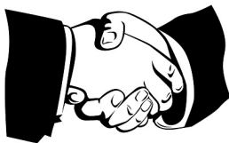
Job Finding Assistance