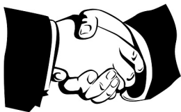
Job Finding Assistance